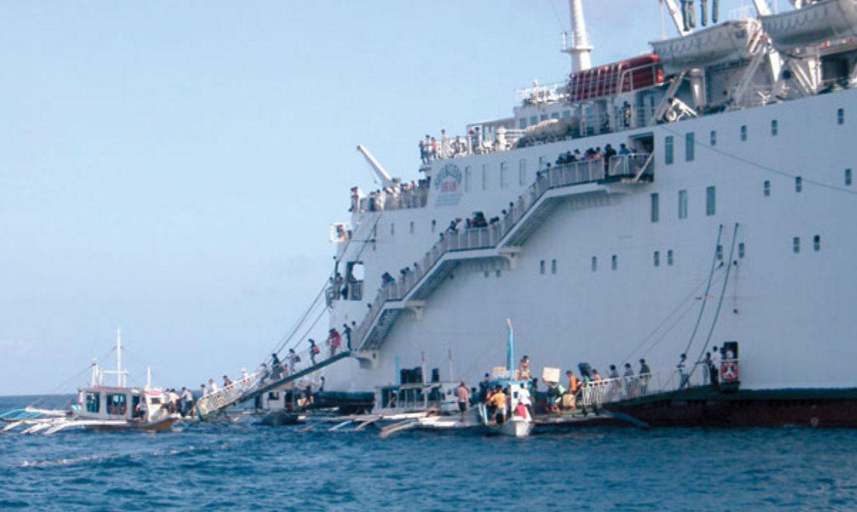
ARRIVAL AT CATICLAN